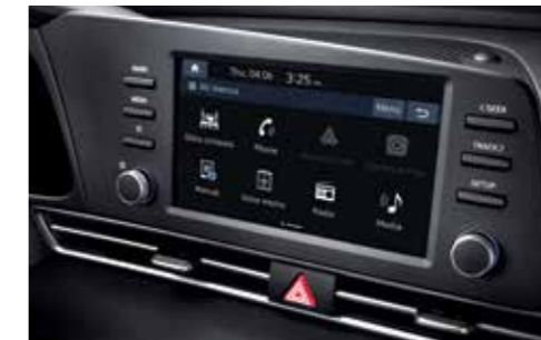
8" Display Audio System