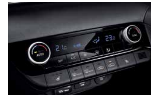
Dual Full Auto Air Conditioner