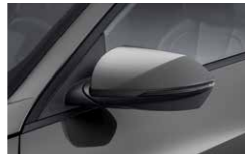
Exterior Sideview Mirrors (heated, power folding, LED turn signal indicators)