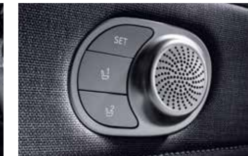
Memory System For Driver's Seat