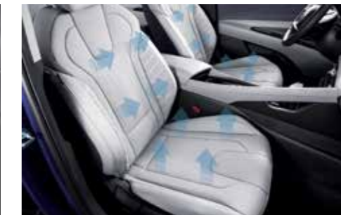
Ventilated Front Seats