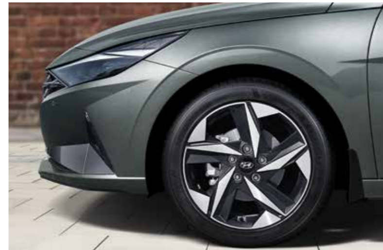
LED Headlights 17" Alloy Wheels & Tires