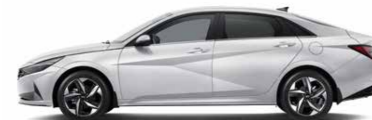
Wheelbase Overall Length 2,720 4,675