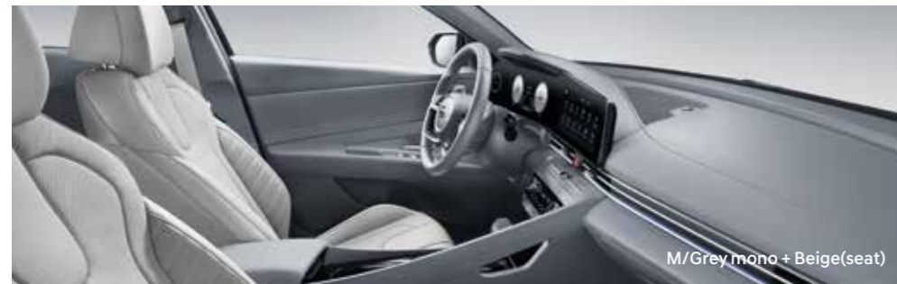
M/Grey mono + Beige(seat)