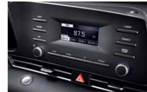
Basic Audio System