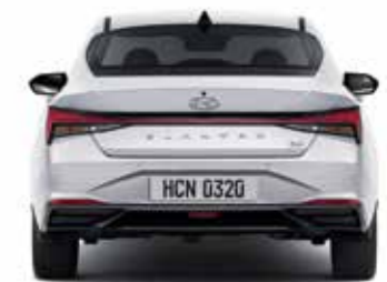
Wheel Tread Overall Width 1,604(1,590) 1,825