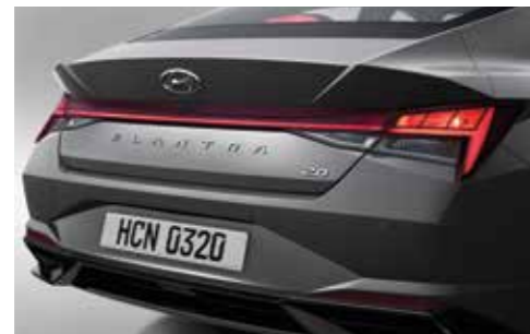
LED + Bulb Rear Combination Lamp