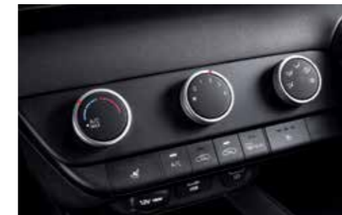
Manual Air Conditioner