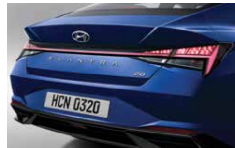
LED Rear Combination Lamp