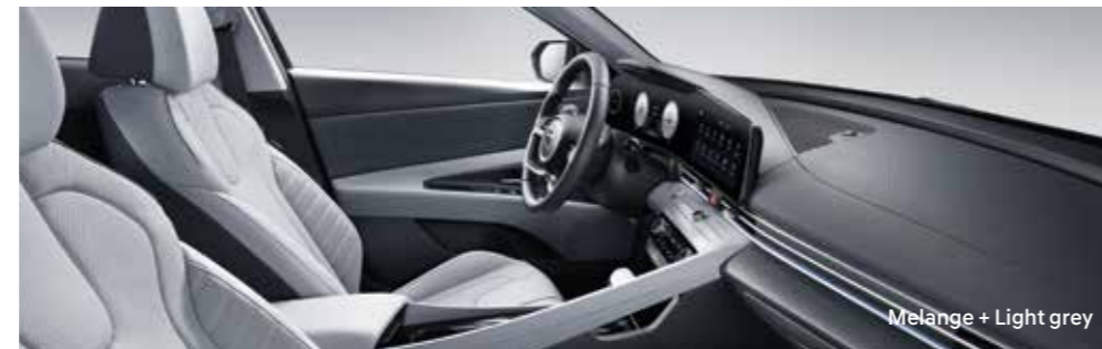
Melange + Light grey