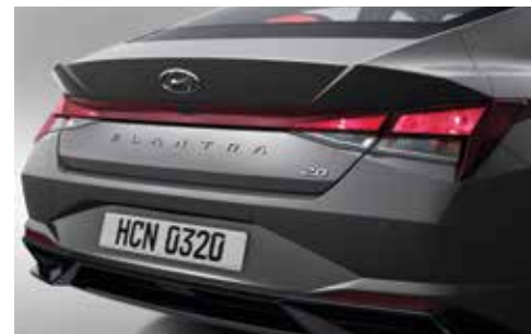
Bulb Rear Combination Lamp