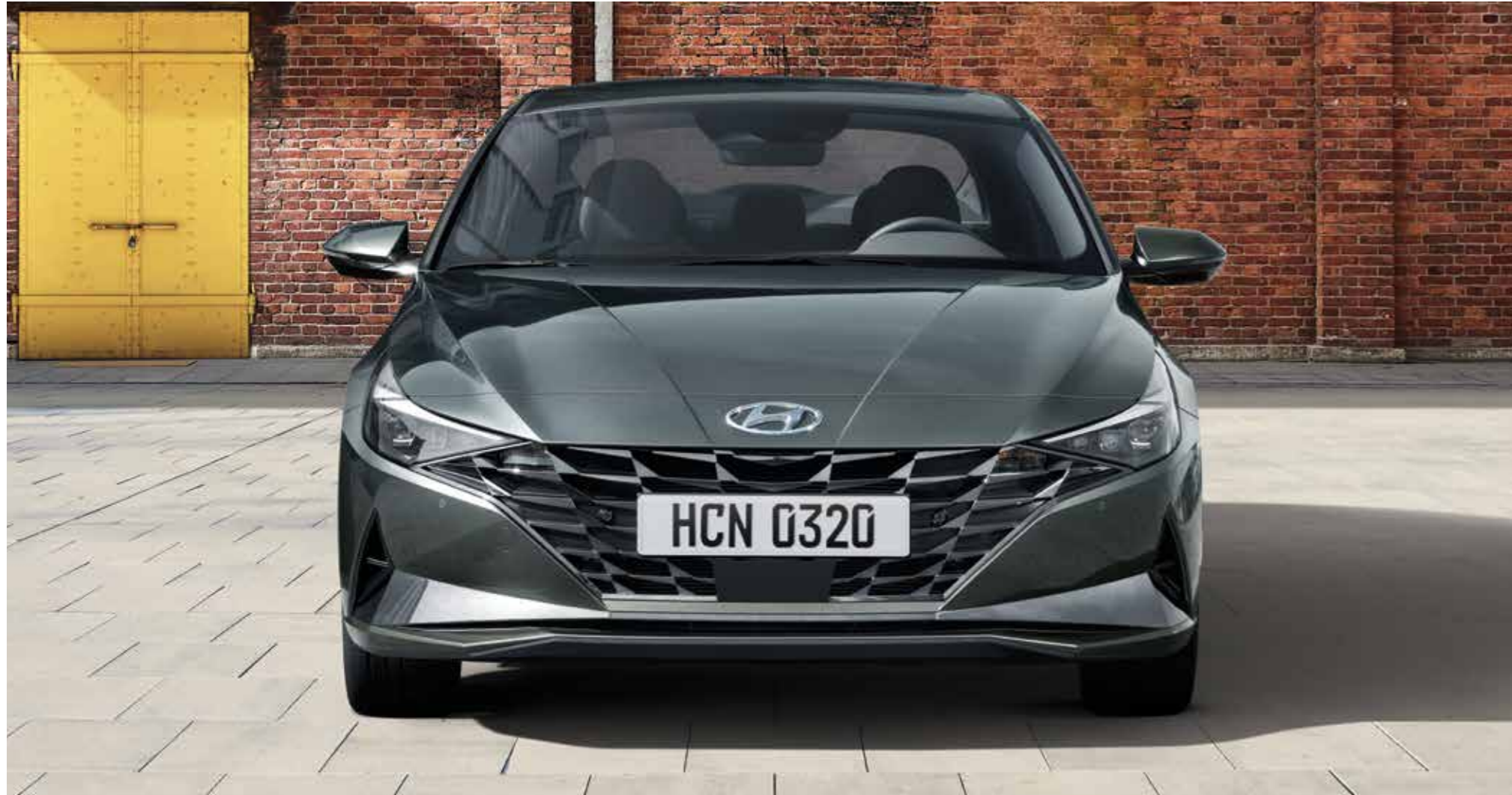
Parametric Jewel Pattern Grille

The stereoscopic Parametric Jewel-pattern design highlights the depth of the front grille, making it resemble diamond-cut gemstones, and the bold and elongated front headlights come together to give Elantra its front sporty look.