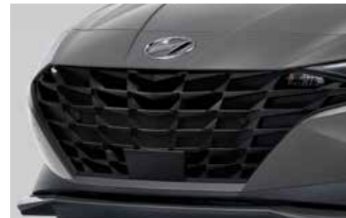
Black Radiator Grille