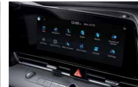
10.25" Navigation Display