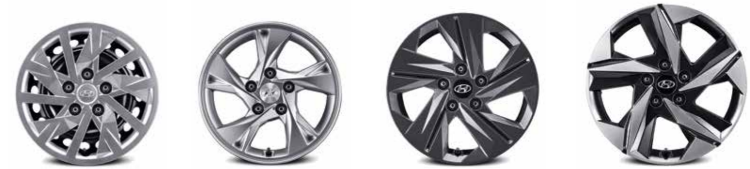
15" Steel Wheel & Wheel Cover