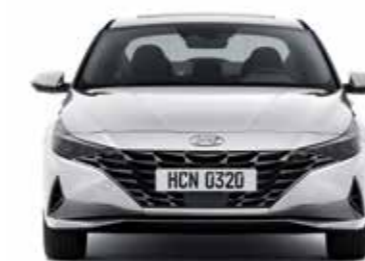
Wheel Tread Overall Width 1,593(1,579) 1,825

Unit : mm, Wheel tread is based on 15" tires, and the number in parenthesis is based on 17" tires.