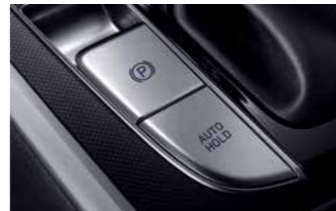
Electronic Parking Brake