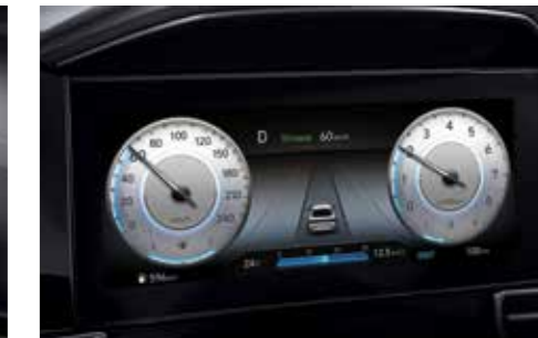
10.25" Full Color Cluster Display