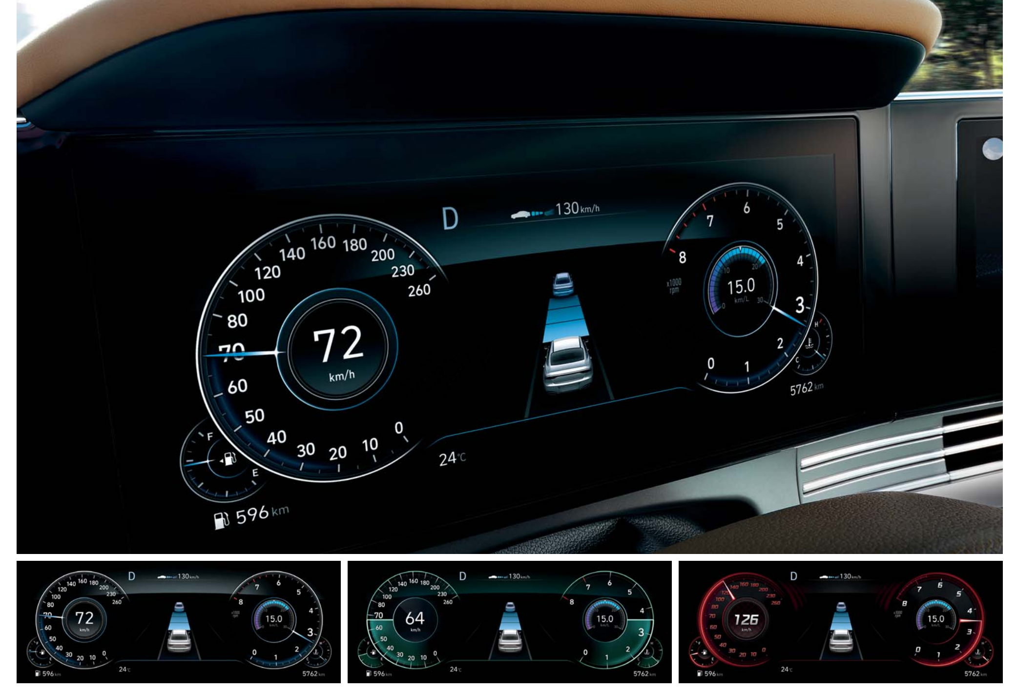
12.3" Full LCD cluster (with Comfort, Eco and Sport driving modes)