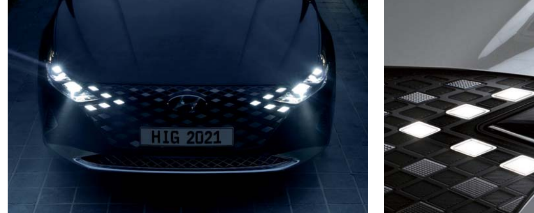
Integrated parametric jeweled grille

It only takes one look at the new Azera to see it is truly exceptional. Its wide, eye-catching grille has jewel-like inserts and dapper chromed accents. It's flanked by distinctively-shaped LED headlights that illuminate the night with their unique geometric pattern. They provide the crowning touch of perfection.