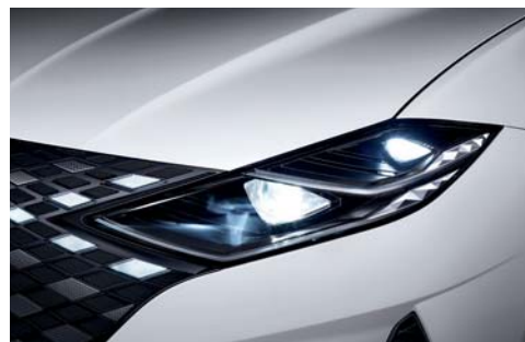
Full LED headlamp and hidden DRL