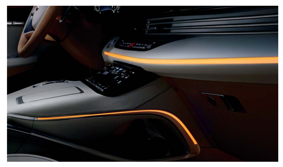
64-Color ambient mood lamp

Traveling in first-class shouldn't be a rare occasion. With the new Azera, you're confirmed for first-class travel all the way, every day. The premium experience begins when you approach the car and the new Azera automatically lights up to signal it's ready; The gently-arched rear LED lights notably create a distinctive signature befitting of something special. Once inside, you can adjust the 64-color ambient lighting to best suit your mood.