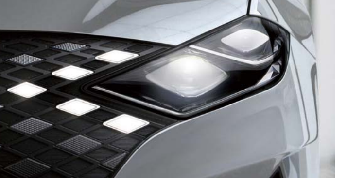
LED headlamps / Daytime running lights