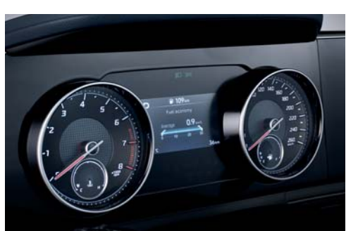
4.2" Supervision cluster