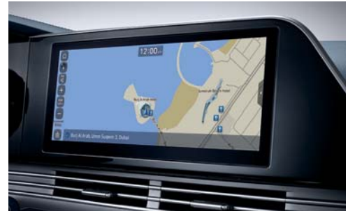
12.3″ LCD touchscreen navigation